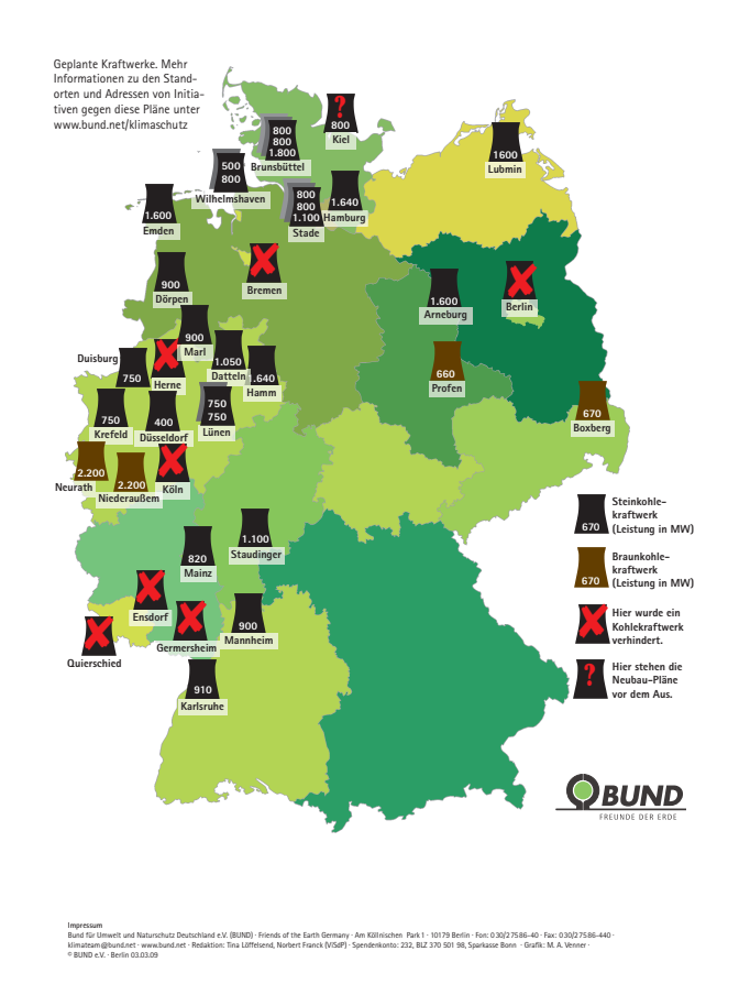
Figure 1: Coal-fired power plants currently planned or under construction.