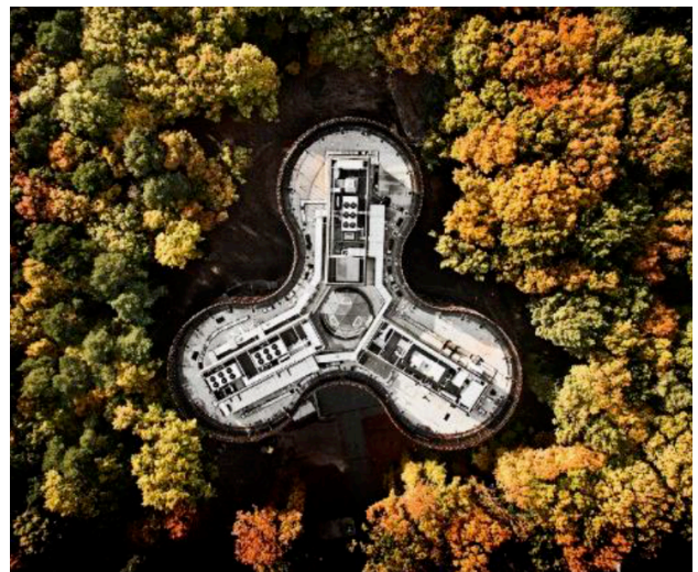
PIK Trefoil