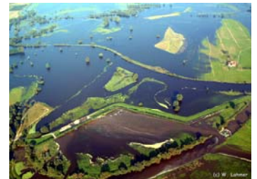
Figure 1: Havel river flood 2002