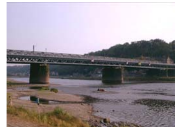
Figure 2: Elbe river drought 2003