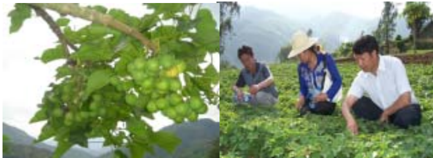
Figure 1 Jatropha seeds and Jatropha demonstration base in Sichuan province

Since 2005, china have initiated the plantation of Jatropha and constructed the demonstration Jatropha forests. This act is called "Forestry-Oil integration" which covers 12 provinces. Up till now, the country have already planted 136 thousand hectares of bushy Jatropha trees, and this figure will increase gradually according to conservative government estimates.(SFA,2009)