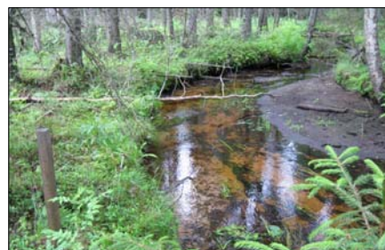
Finnish WKH: a brook