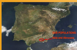
Location of the villages, South of Spain (Andalucía)

A rich local tradition linked to natural resources is disappearing and the potential of local resources is not being appropriately assessed and utilized.