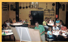
Participation workshop in Abia, June 2007

We are six people working within a multidisciplinary group- an ecologist, a biologist, two economists a consultant and an environmentalist.