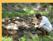
Taking macroinvertebrates samples