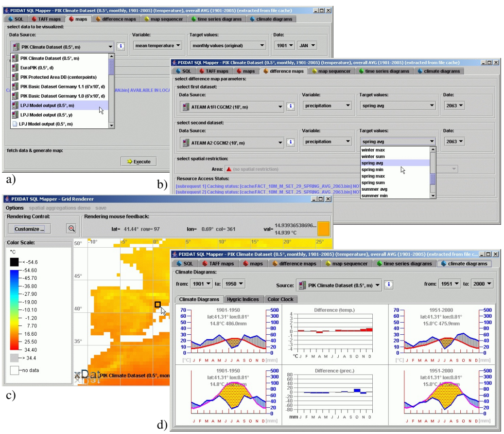
Wrobel et al. / Graphical User Interface Design for Climate Impact Research Data Retrieval